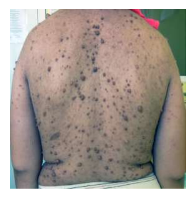
Fig. 1. Cutaneous manifestations of NF1 on the posterior chest, right and left upper limbs: neurofibromas and café au lait spots

breast, extending to the nipple-areolar complex (Figure 4) [7].