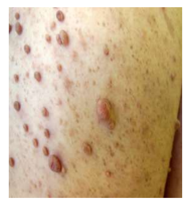
Fig. 3. Neurofibromas and café au lait spots on the teguments of the right lumbar region