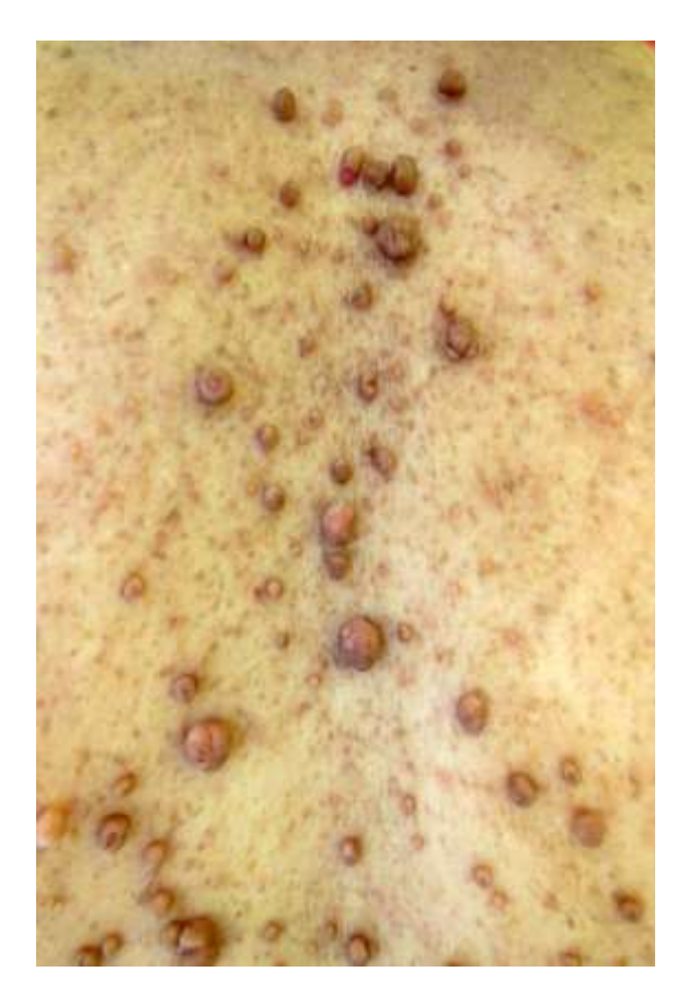
Fig. 2. Neurofibromas on the teguments of the posterior thoracic region