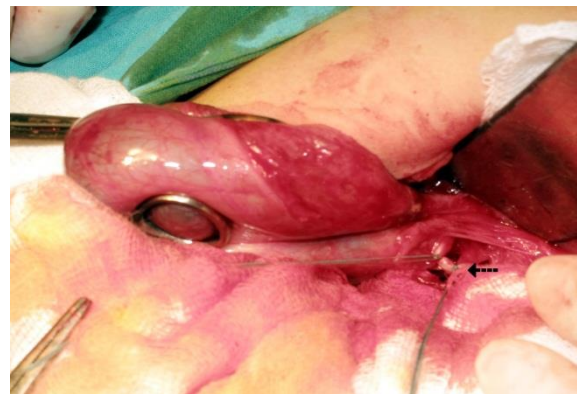
Fig. 3. Intra-operative appearance of the gallbladder, cystic duct ligature (mark highlights)

The clinical outcome after surgery was favorable, with drainage tube removed after 72 hours and the patient was discharged 6 days after surgery.