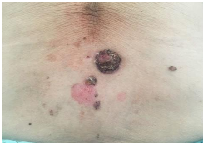
Fig. 1. Lumbar ulcerated pigmented tumor

Biochemical analyses were in normal range. Urine culture was positive for E. coli .