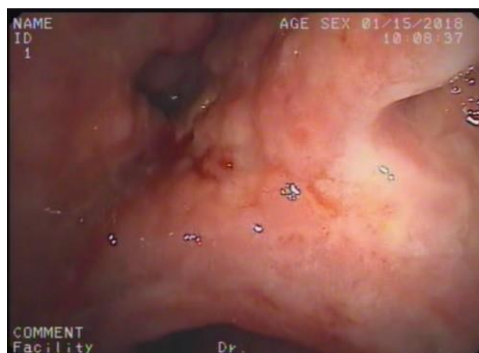
Fig. 3.b. Pseudo-diverticular area of the rectal lesion